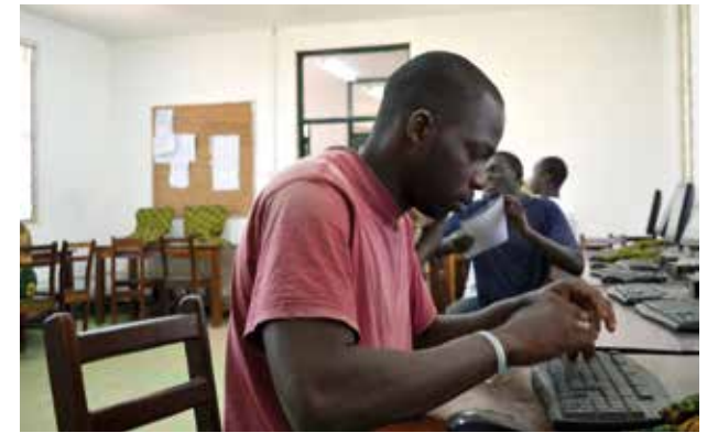
Commerce and Business Administration