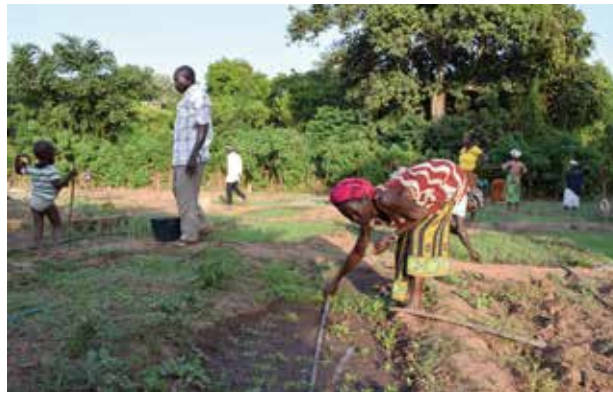
Agriculture and Livestock