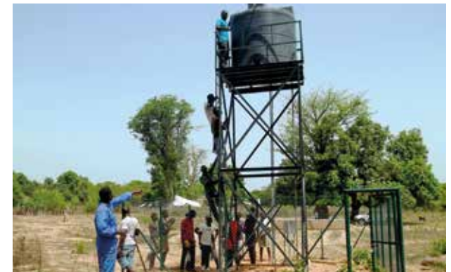
Plumbing and Water Pump Repair