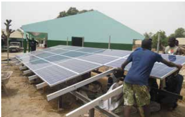
Solar Energy Technology